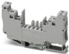
Base element with screw connection technology for CB... device circuit breakers

Please be informed that the data shown in this PDF Document is generated from our Online Catalog. Please find the complete data in the user's documentation. Our General Terms of Use for Downloads are valid ( http://phoenixcontact.com/download )